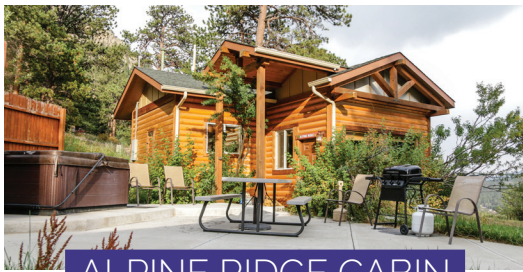
ALPINE RIDGE CABIN