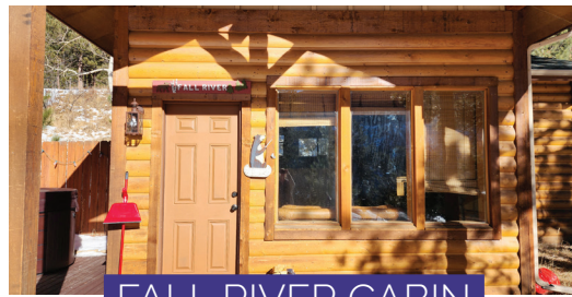
FALL RIVER CABIN

King Bed | 1 Bedroom | Hot Tub | Fireplace | Open Floor Plan | Fully Equipped Kitchen | Wood Burning Stove | Satellite TV and DVD